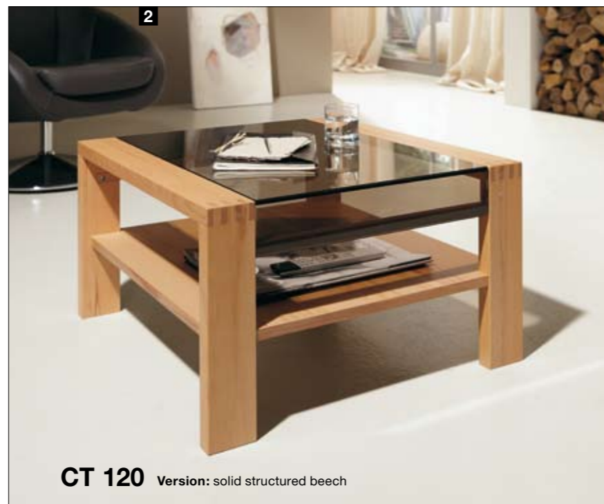
CT 120 Version: solid structured beech

2 Less is more! The CT 120 with its clean and simple lines and the solid wood frame provides a stunning visual impact even without the drawer. Available in 70 x 70 cm or – as a slightly larger version – in 90 x 90 cm square.