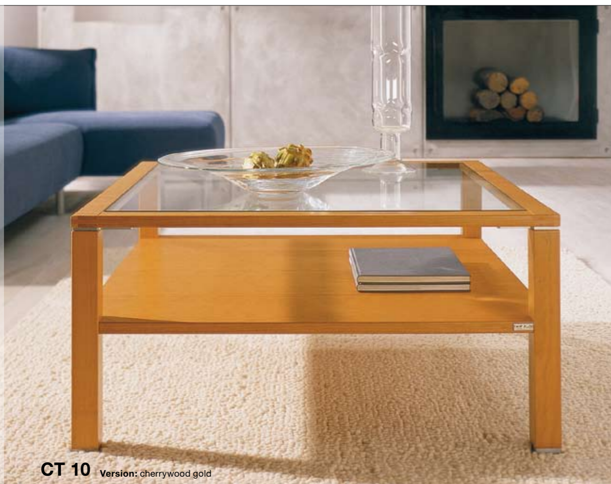
CT 10 Version: cherrywood gold