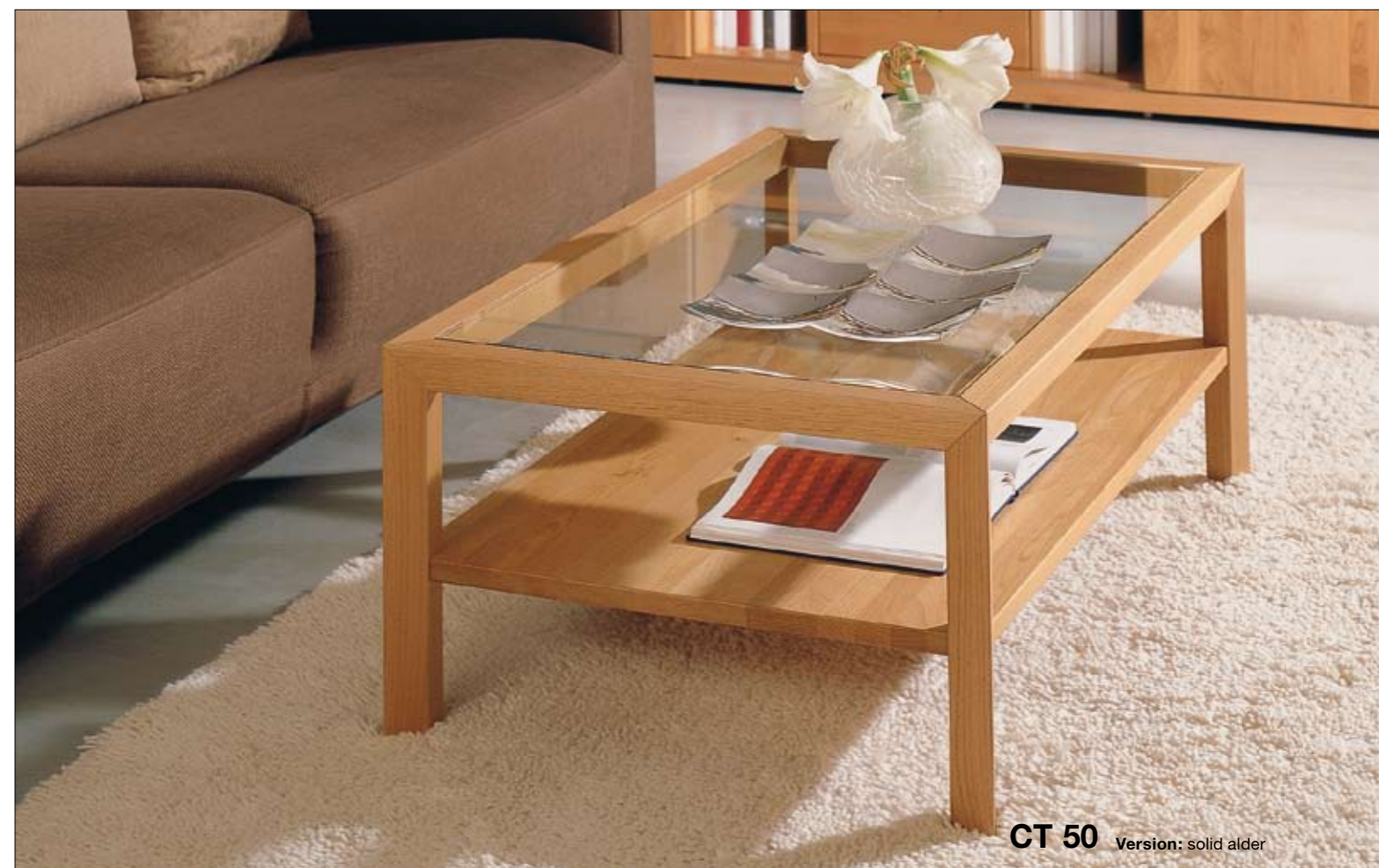
CT 50 Version: solid alder