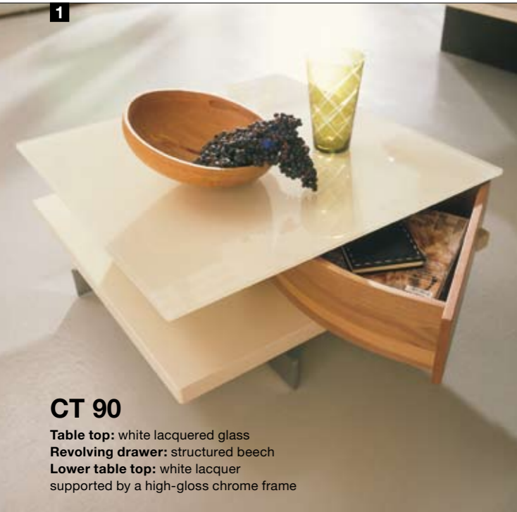
CT 90 Table top: white lacquered glass Revolving drawer: structured beech Lower table top: white lacquer supported by a high-gloss chrome frame

to float, defying gravity, whilst the beautifully clean and simple lines of the coffee tables are irresistibly attractive.