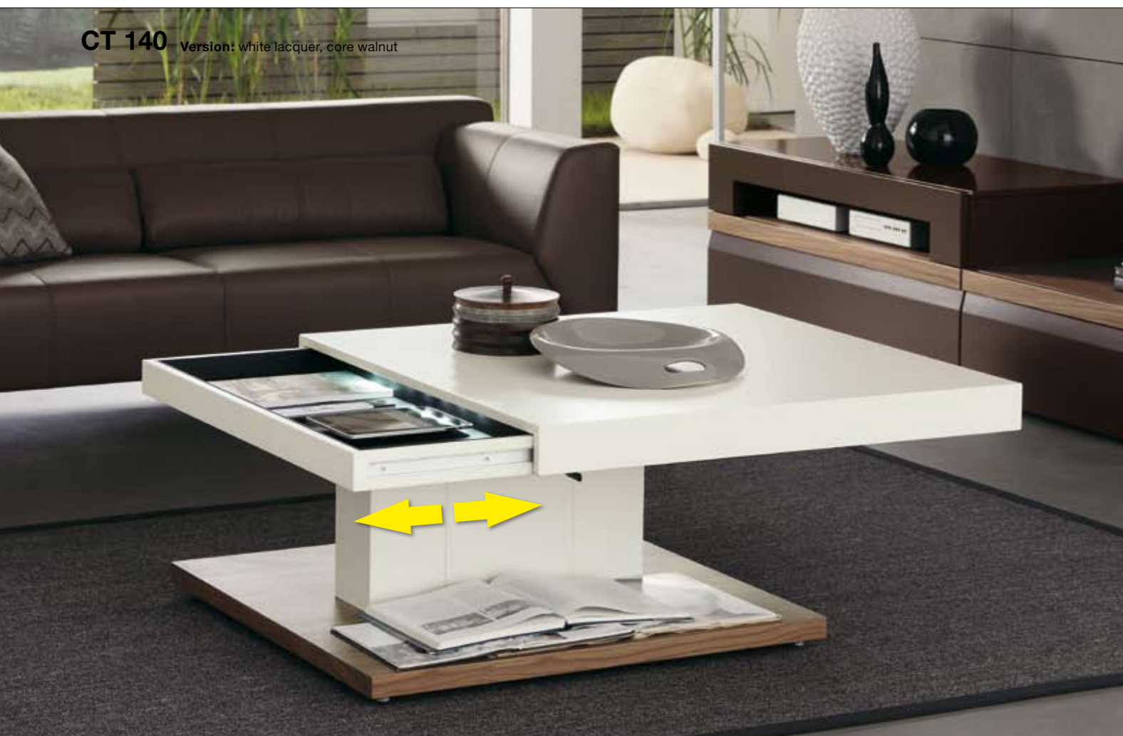
CT 140 Version: white lacquer, core walnut

the top one in white lacquer or brown-black lacquer. The tabletop can be adjusted to any height and even be pushed aside. Underneath, there is a practical compartment, which can even be fitted with interior lighting if required.