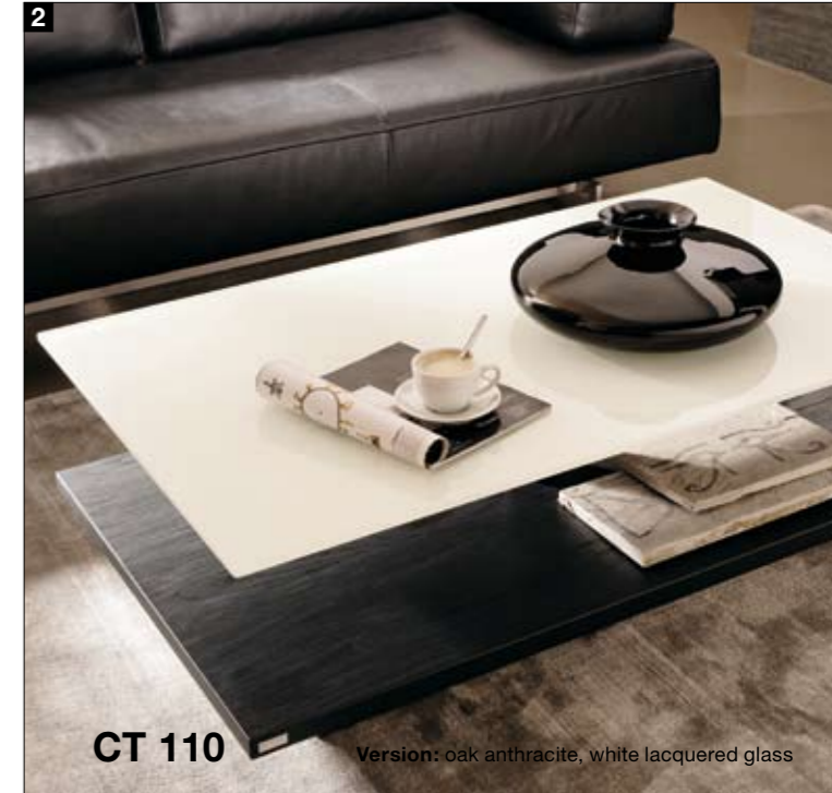
CT 110 Version: oak anthracite, white lacquered glass