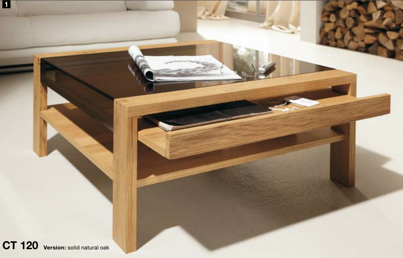
CT 120 Version: solid natural oak

3 A completely different look using almost the same components. The white lacquered table top beautifully highlights the central wooden feature. The two 70 x 70 cm table tops offer plenty of space.