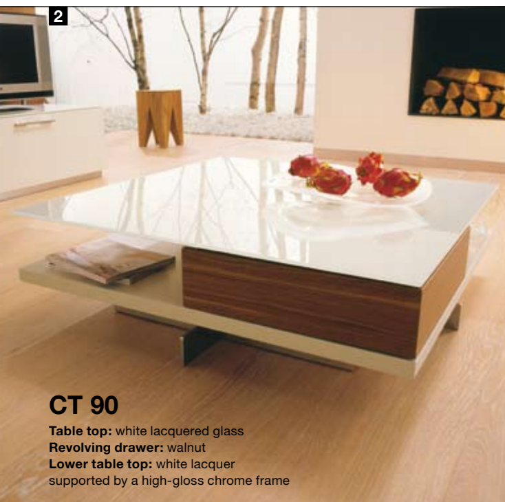
CT 90 Table top: white lacquered glass Revolving drawer: walnut Lower table top: white lacquer supported by a high-gloss chrome frame