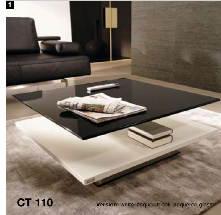
CT 110 Version: white lacquer, black lacquered glass