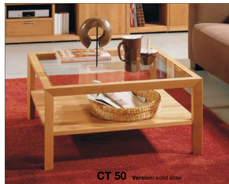
CT 50 Version: solid alder

Square or rectangular: the 45.0 cm high CT 10 is available in 70 x 70, 90 x 90 and 120 x 70 cm. The upper table top is available in wood, sand or white rear-lacquered glass, in clear glass, satinized or stained glass. The lower table top is always made from wood.