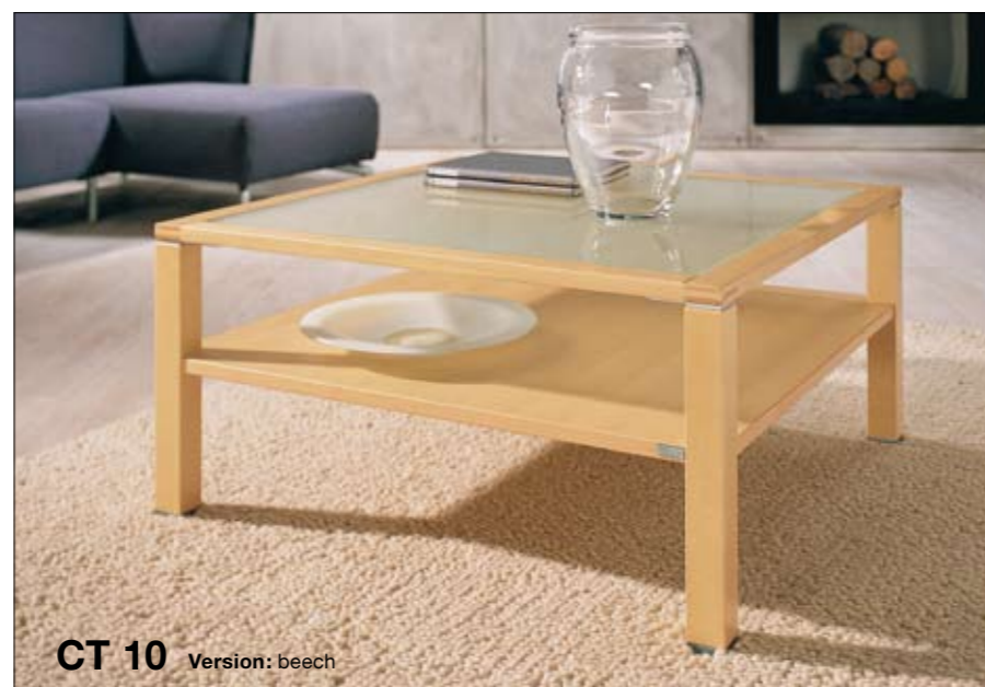
CT 10 Version: beech

Square or rectangular: the 45.0 cm high CT 10 is available in 70 x 70, 90 x 90 and 120 x 70 cm. The upper table top is available in wood, sand or white rear-lacquered glass, in clear glass, satinized or stained glass. The lower table top is always made from wood.